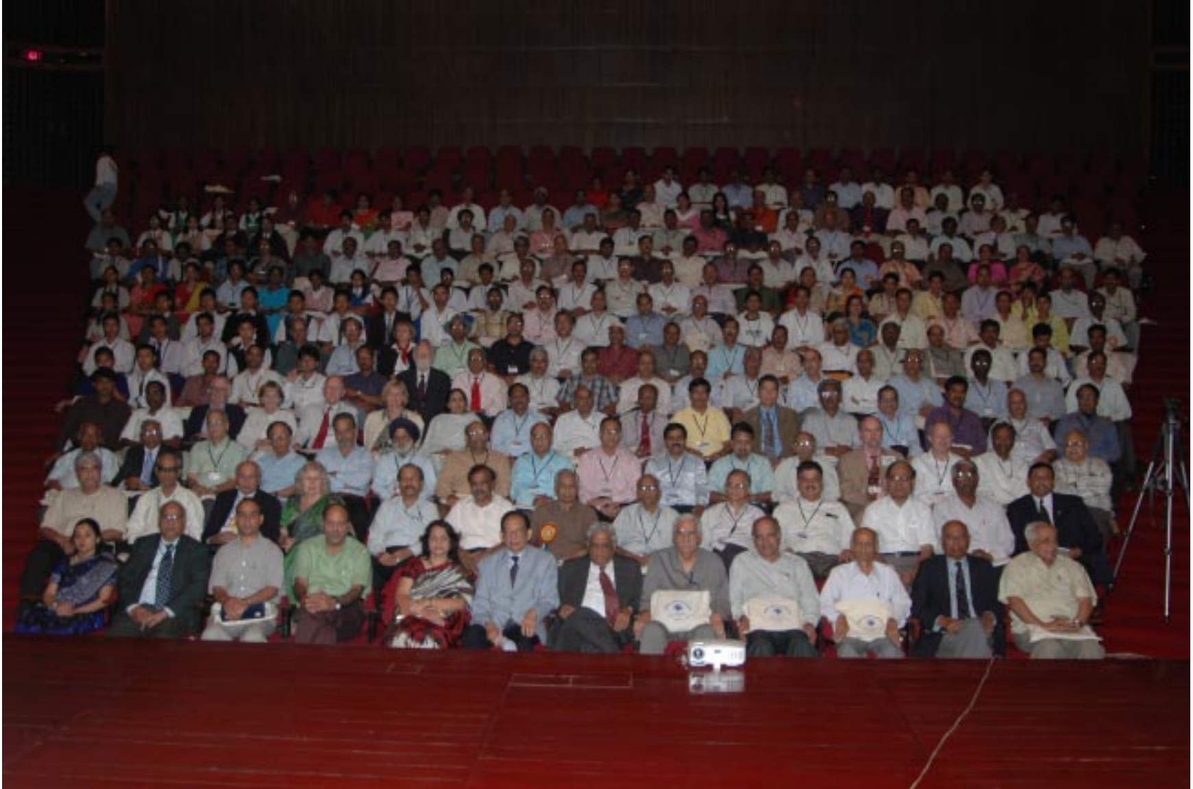
A section of the participants at the Golden Jubilee Celebrations of the Geological Society of India.